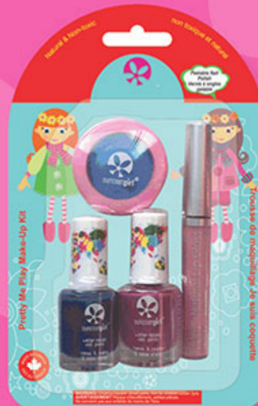
Item #00978 Mermaid