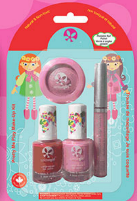
Item #00983 Angel